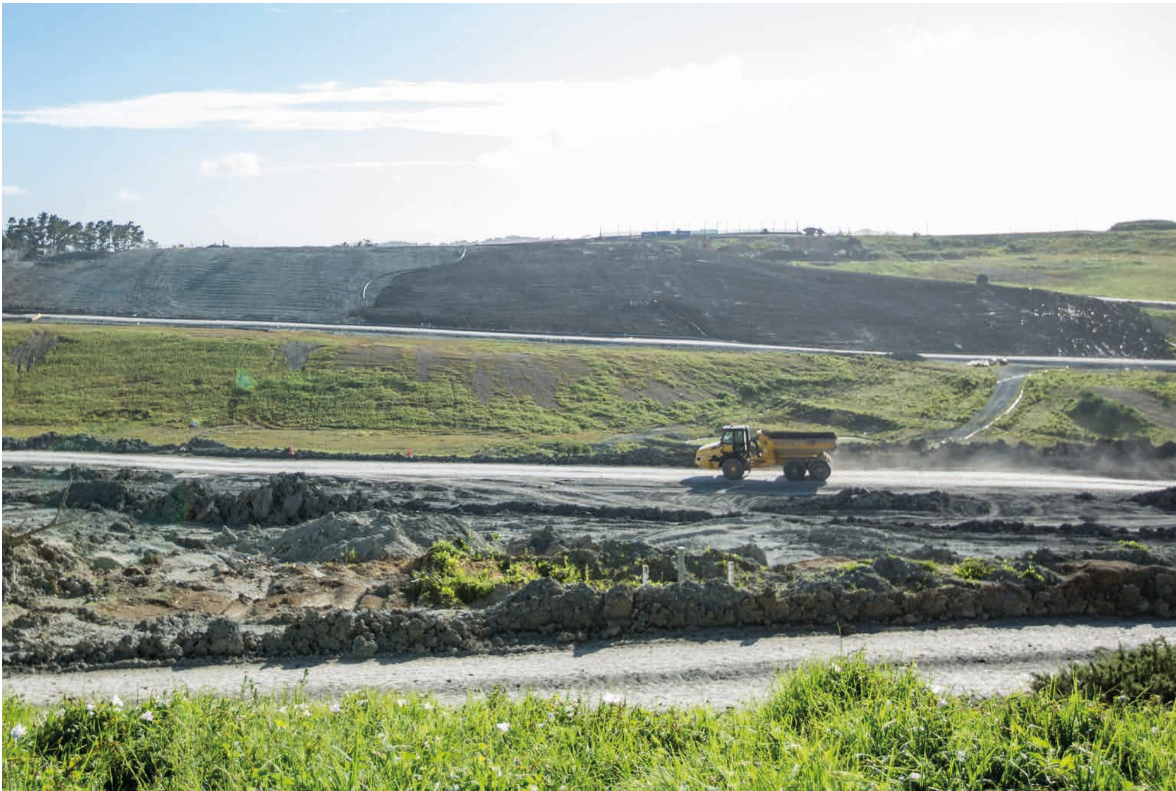
Redvale Landfill and Energy Park, Dairy Flat