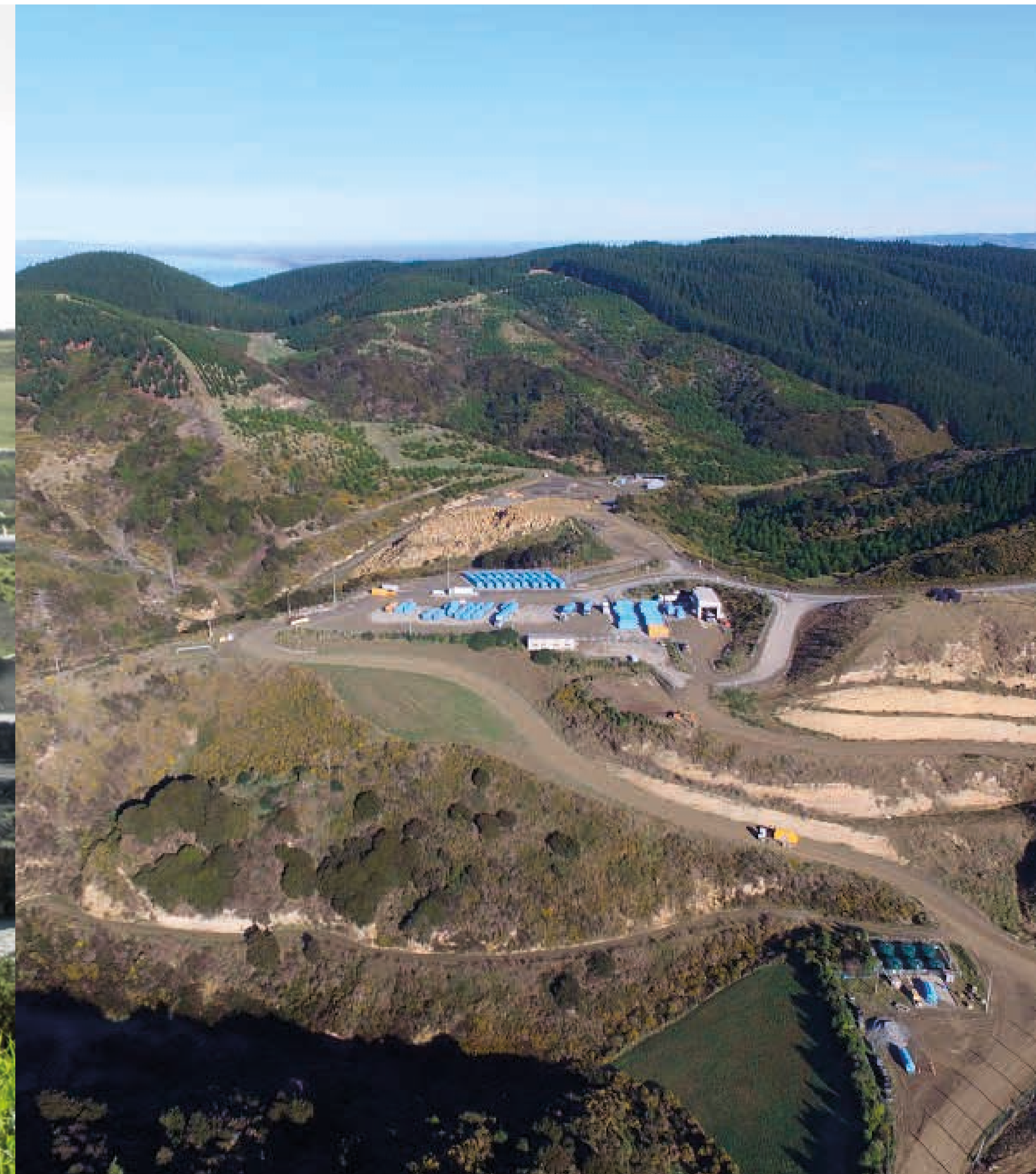
Kate Valley Landfill and Energy Park, Hurunui District, North Canterbury