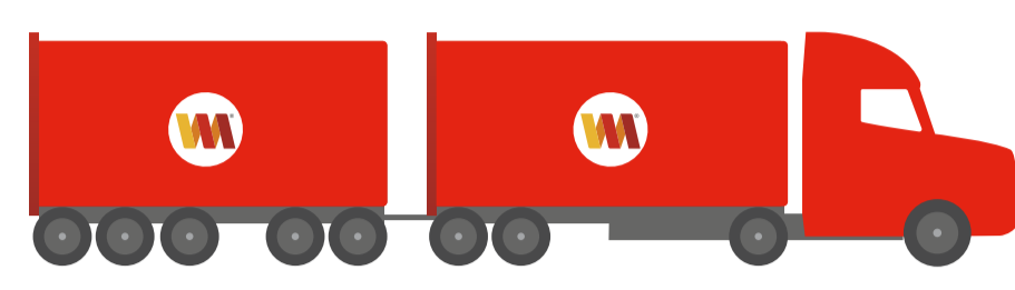
WM Bin Trucks

Peak Return Trips per Day: 200 (Years 1-5)