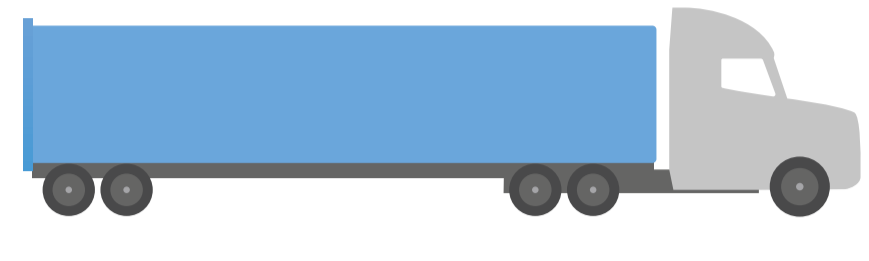
Transfer Trucks and Other Trucks

Peak Return Trips per Day: 200 (Years 1-5)